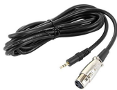
Cable 1,5mt XLR female – Jack 3,5 3 way