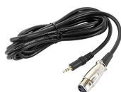
Cable 1,5mt XLR female – Jack 3,5 3 way